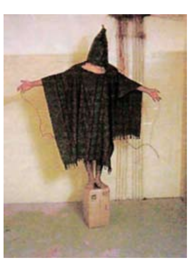
The notorious Ghraib image

The development of small hand-held cameras allowed the Boer War to be recorded in depth using film. Because photographs were cheaper than drawings by good artists, newspapers were increasingly illustrated with photographs of varying quality. Because the war was fought by mobile columns seeking to track down Boers adept in concealment and movement, it has been concluded that photographs of actual combat were 'virtually impossible to obtain, and the pictures that were taken had a static, lifeless, almost staged appearance about them.'4